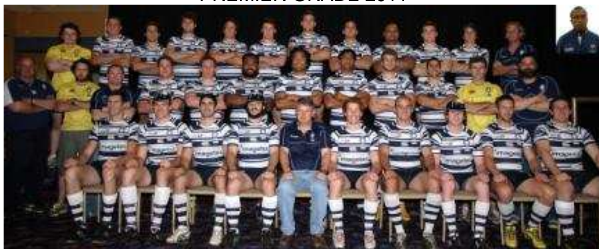
GRAND FINALISTS, Winners of the Templeton-McLean Cup & Flynn-Lewis Memorial Shield