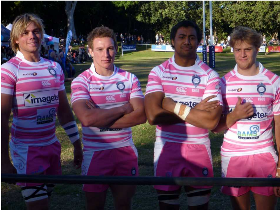
Brothers Rugby Club – LADIES DAY 2011