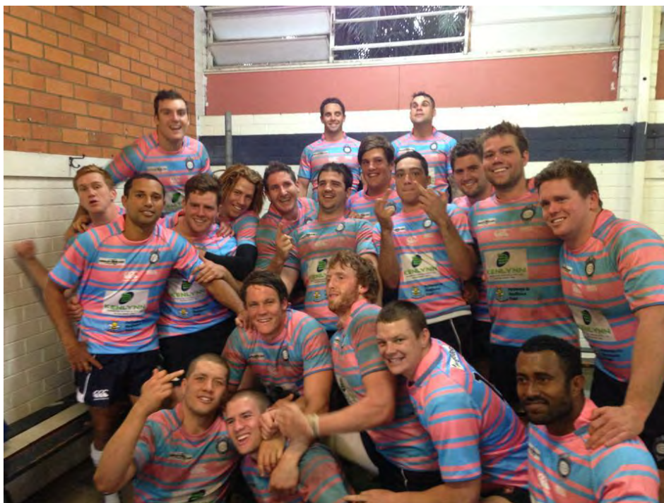
2013 LADIES DAY vs. Eastern Districts