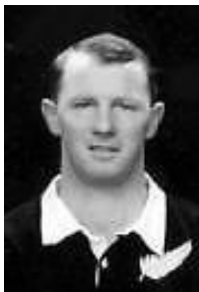
Desmond Michael CONNOR

2001: Brothers' Team of the Century 2007: Queensland Team of the Century 2008: ARU - Wallabies Hall of Fame